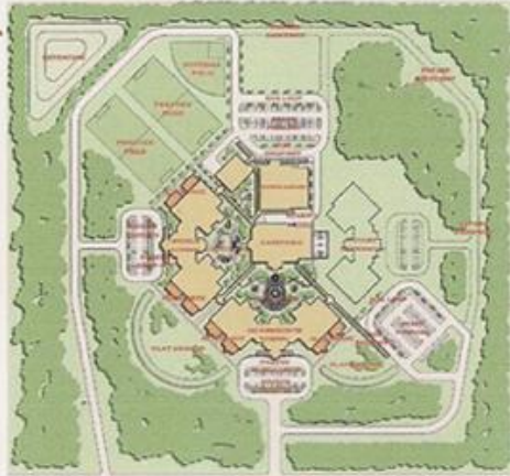
PROPOSED Central school complex is taking shape after numerous public meetings

PBK Architects, which has the architectural contract for the new schools, has conducted the charrettes, which are intended to bring school administrators, teachers, elected officials, and the general