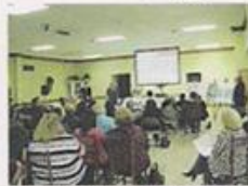
PBK Architects held the final School Design Charrette last Thursday at Kristenwood.